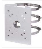
PFA150 Pole Mount