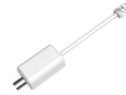
LR1002 ePoE Over Coax Converter